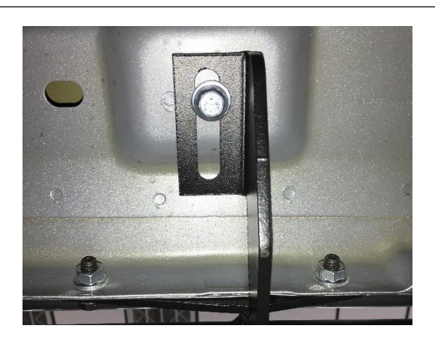
Step 10. Repeat steps 4-9 for the Driver side.