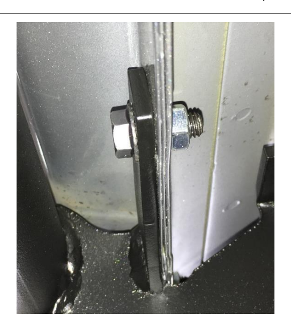
Step 9. Next, tighten the remaining hardware that attaches the bracket to the upper body mount.